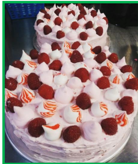
Fresh Blanket of Snow From PH1